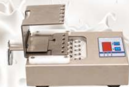
1st when placing the test vials into the thermostatic device.