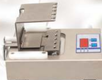
2nd when placing the test strips into the strip holder.